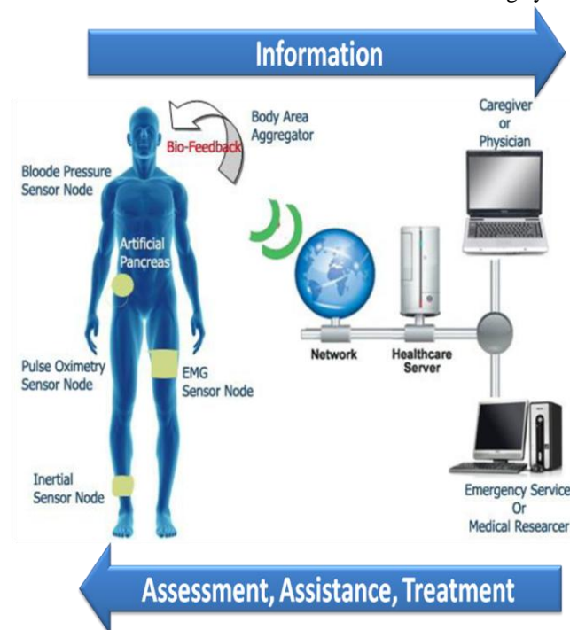
Figure.2.0. Overview of wearable sensors for remote healthcare monitoring system